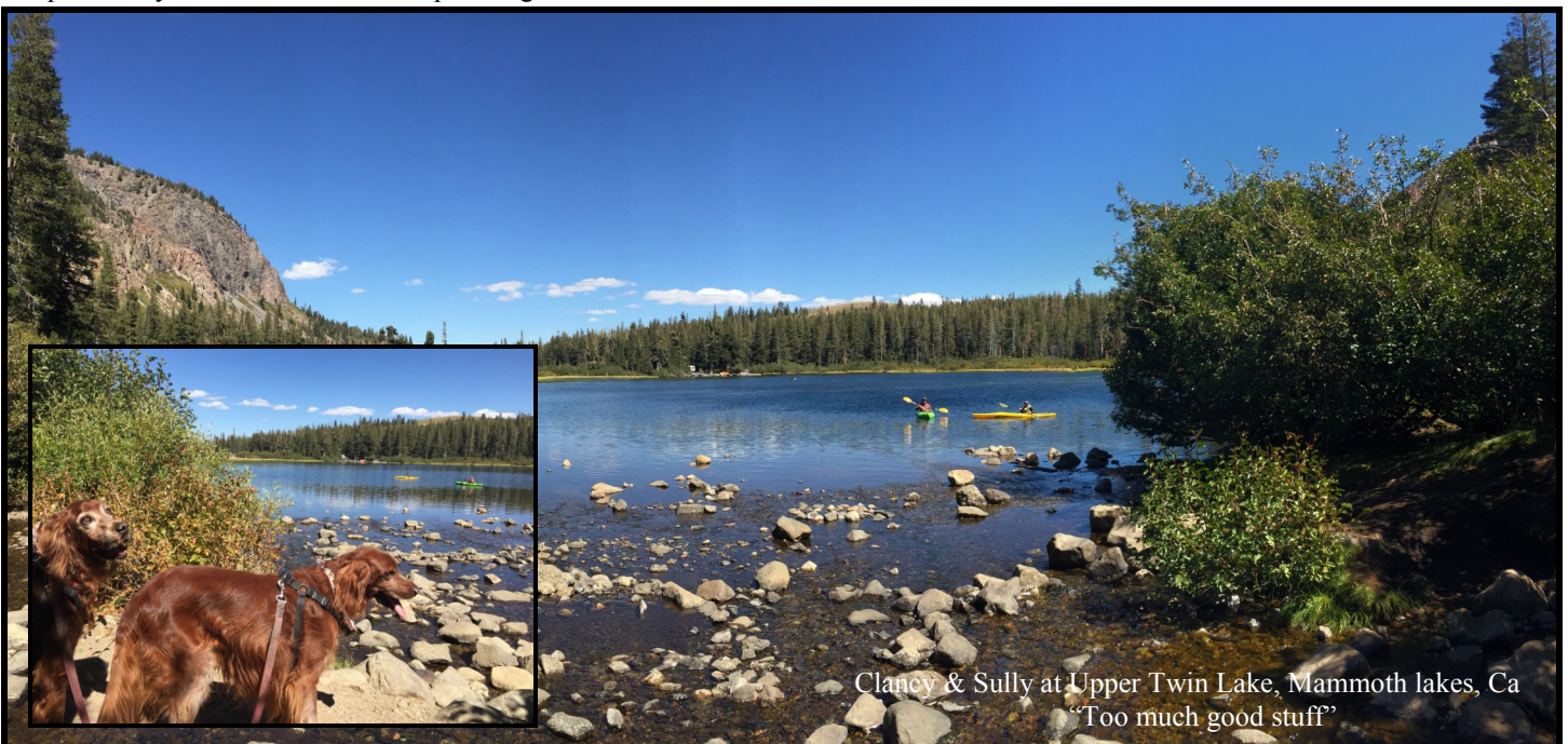
Clancy & Sully at Upper Twin Lake, Mammoth lakes, Ca "Too much good stuff"

Hope to see you at several of these upcoming events.